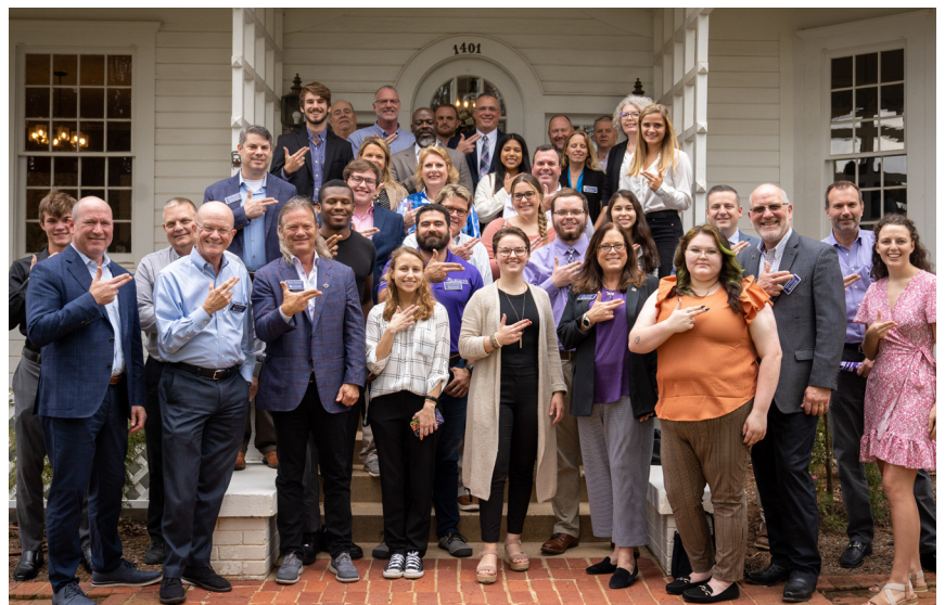
Members of the College of Business Executive Advisory Board and their respective mentees met for lunch at SFA's Culinary Café during the fall 2022 EAB meeting.