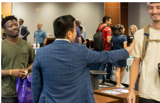
Representatives from more than a dozen Texas banks discussed careers in banking at November's Banking Exposition sponsored by the Chadwick Family Banking Program.